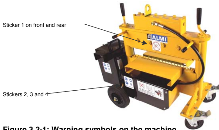
Figure 3.2-1: Warning symbols on the machine