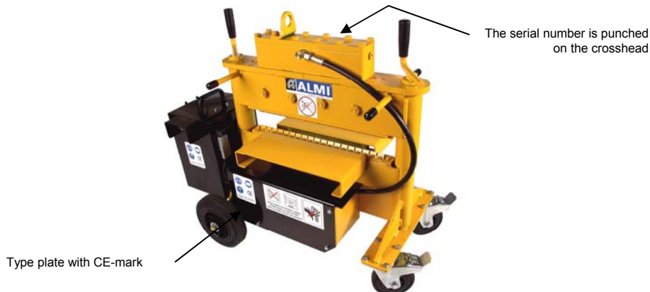
Figure 2.3-2: Location of the type plate and serial number

For the location of the attached CE-mark and type plate, see Figure 2.3-2.