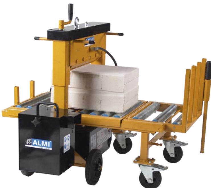
3. Position the block with the greatest of ease.