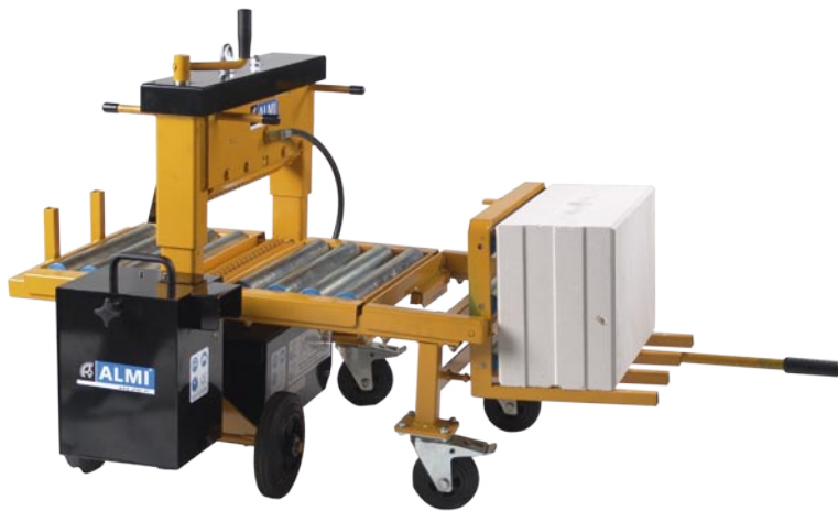
1. Block is placed on the machine.