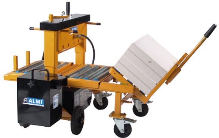
2. The shaft with joint is close to the centre of gravity of the block, so it's easy to overturn.