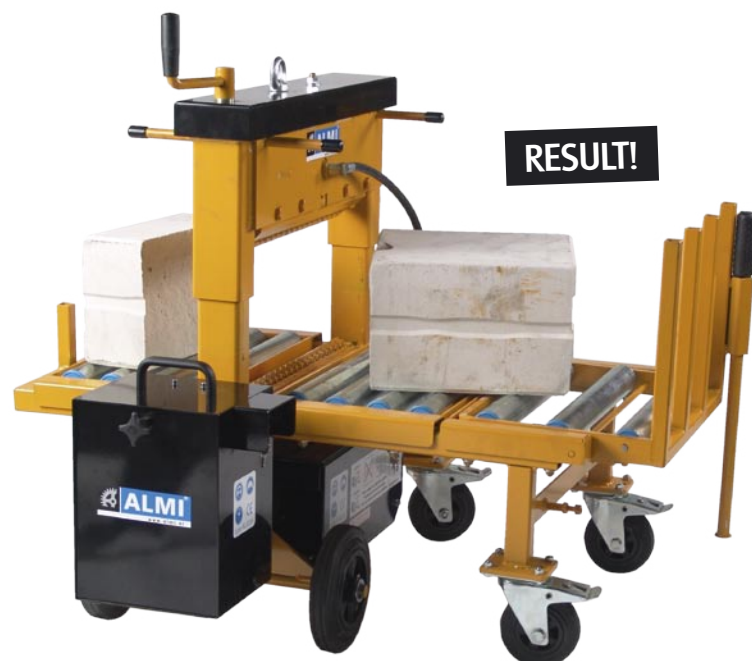
4. Push the button.